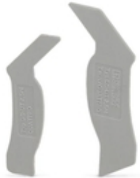
Cover segment, color: gray

Please be informed that the data shown in this PDF Document is generated from our Online Catalog. Please find the complete data in the user's documentation. Our General Terms of Use for Downloads are valid ( http://phoenixcontact.com/download )